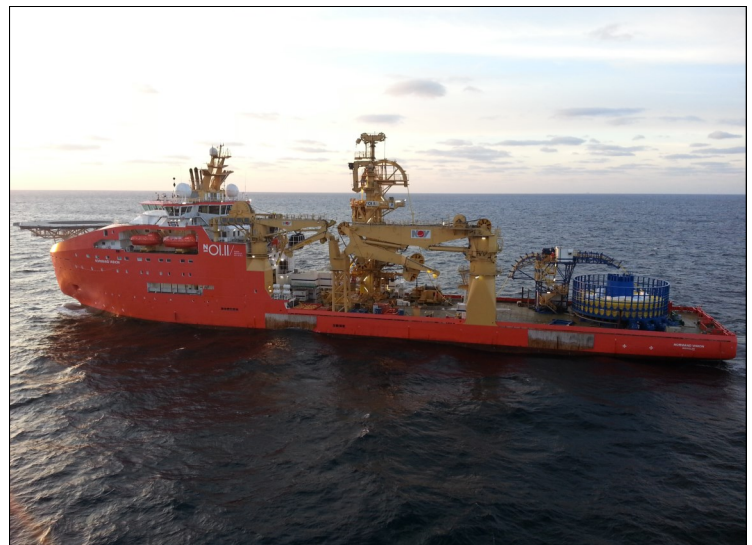
Oceaneering Normand Vision