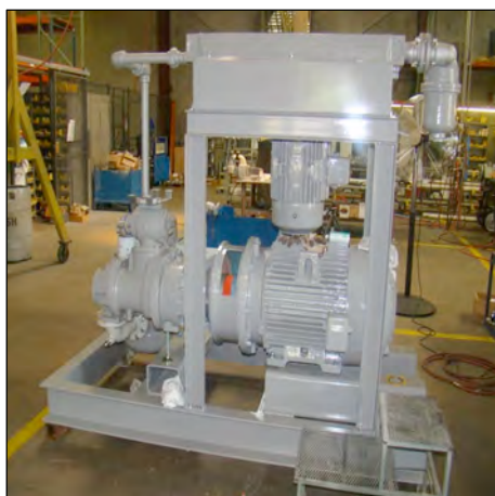
Compressor Unit at Airdyne

The kingpost is in the fabrication area at Wagner Plateworks . The transition section is the final component to be welded to the kingpost. Once complete, the kingpost structure will be shipped to blast and paint followed by to shipment to Seatrx .