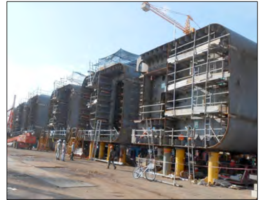
Pontoon Blocks in Pre-Erection Area

,Site team continues Safety Walk-Downs on a weekly basis where the site team reports any discovered safety concerns to HHI for corrective action.