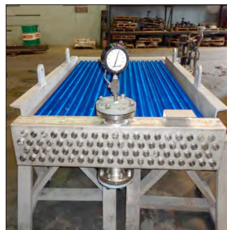
Cooler for the Glycol Regeneration Skid