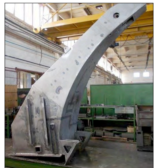
Davit Arm for the Fast Rescue Boat

The Launcher/Receiver skids sit in the staging area at Dynamic Industries . Once all of the piping and components are on location the assembly process will begin.