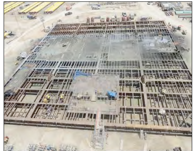
Upper Level Framing