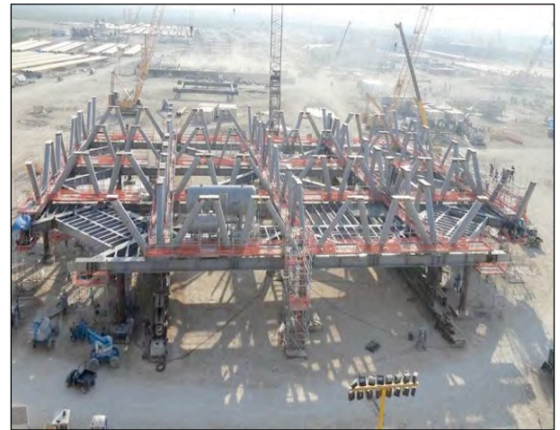
Lower Level Framing

Valves, vessels and miscellaneous company supplied items continue to arrive weekly. The valves and miscellaneous items are being painted weekly.