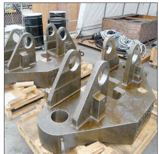
Mooring Jacking System Traveling Cross Arms

Exmar representatives are witnessing fabrication and testing of hull OFE in China, Korea and Europe. Hull owner furnished equipment fabrication is ongoing as can be seen in the photo of the mooring jacking system.