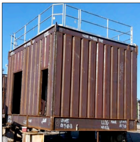
Emergency Generator Building