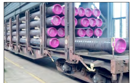
Railcar Loadout of 16in Line Pipe in Germany