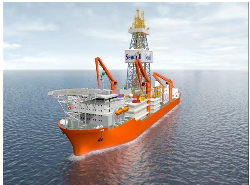
Seadrill West Neptune