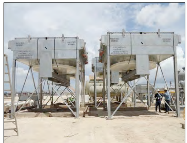
Legs and bracing installed on four large coolers